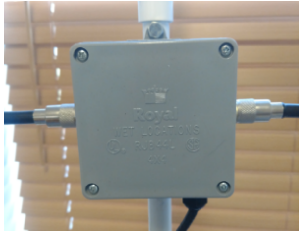
Outdoor Utility box.