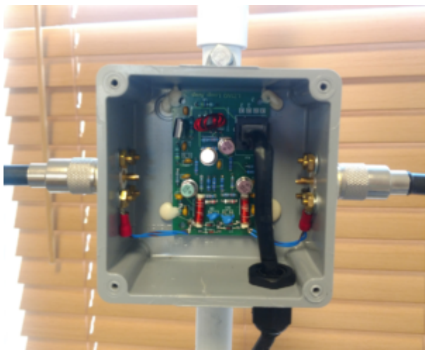
LNA mounted in box