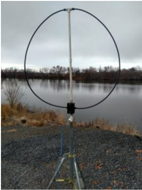
Coax Loop with differential amplifier.