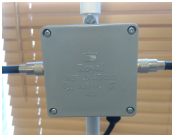
Outdoor Utility box.